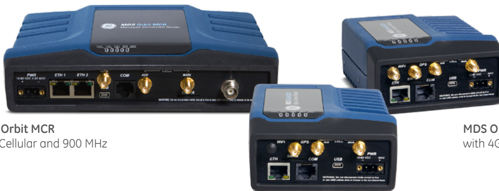
MDS Orbit MCR with Cellular and 900 MHz

A Wi-Fi radio option can be selected as a standalone, or as a secondary radio for licensed, unlicensed or cellular WAN-radios. Orbit's Wi-Fi is based on 802.11 b/g/n and supports speeds of up to 54 Mbps, and up to 7 clients/hosts per AP.